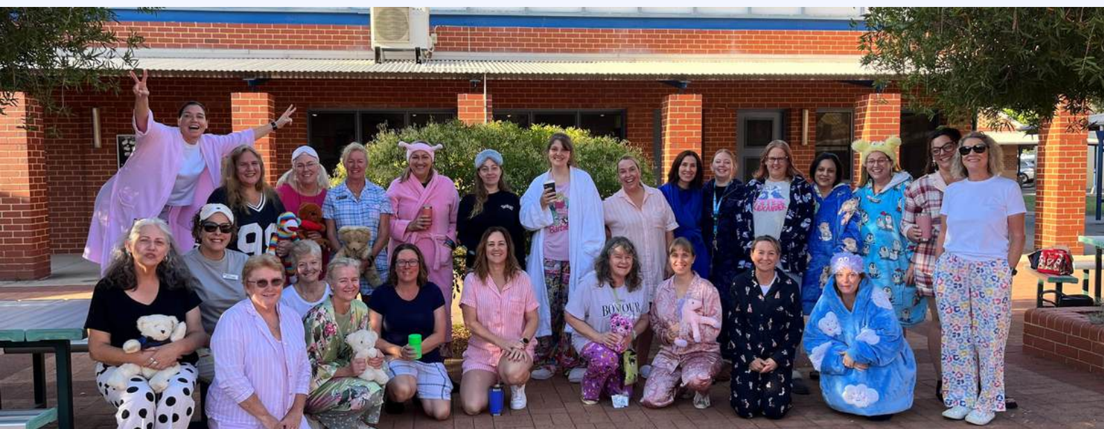
Staff Spirit Week - PJ Day